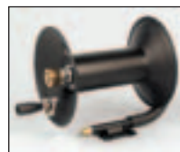
100' E-Zee Hose Reel Kit