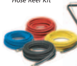
High-pressure hoses from 30 to 150-ft. lengths