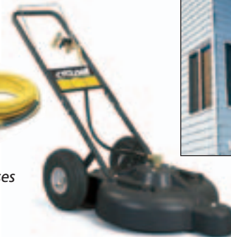
Rotary surface cleaner attaches to your pressure washer; reduces overspray and zebra striping

Smart phone users scan this code to go the Hotsy website